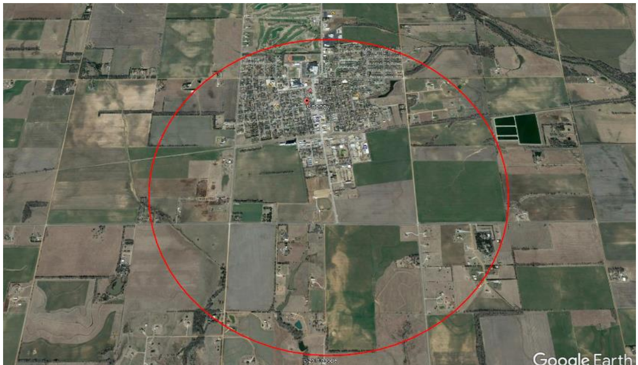
1-mile radius of Activities Complex Recreational Trail

The inclusion of this new trail will meet Kansas SCORP and State Trails Plan criteria, while simultaneously helping the City of Cheney achieve a goal listed in the Comprehensive Plan.