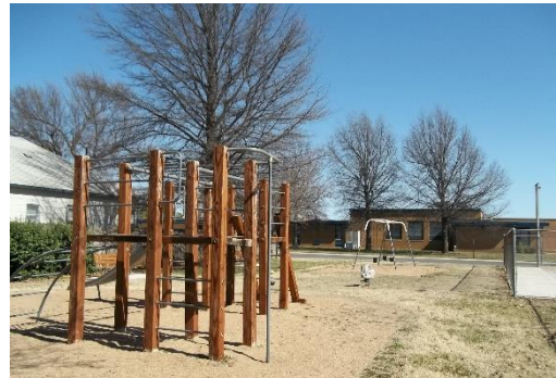
Swimming Pool Park

As its name implies, Swimming Pool Park is located next to the municipal swimming pool at Lincoln & 5 th Ave and features a shelter house with restrooms and playground equipment. The park contains roughly 1.6 acres and has concrete sidewalk adjacent to the road on the south side of the park along 5 th Avenue.