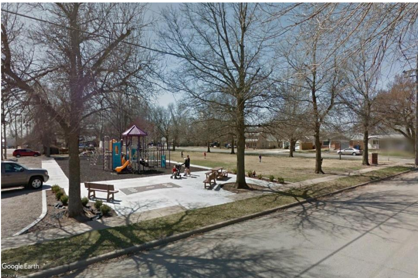
Google Earth 2019-04 Elizabeth Budd Park