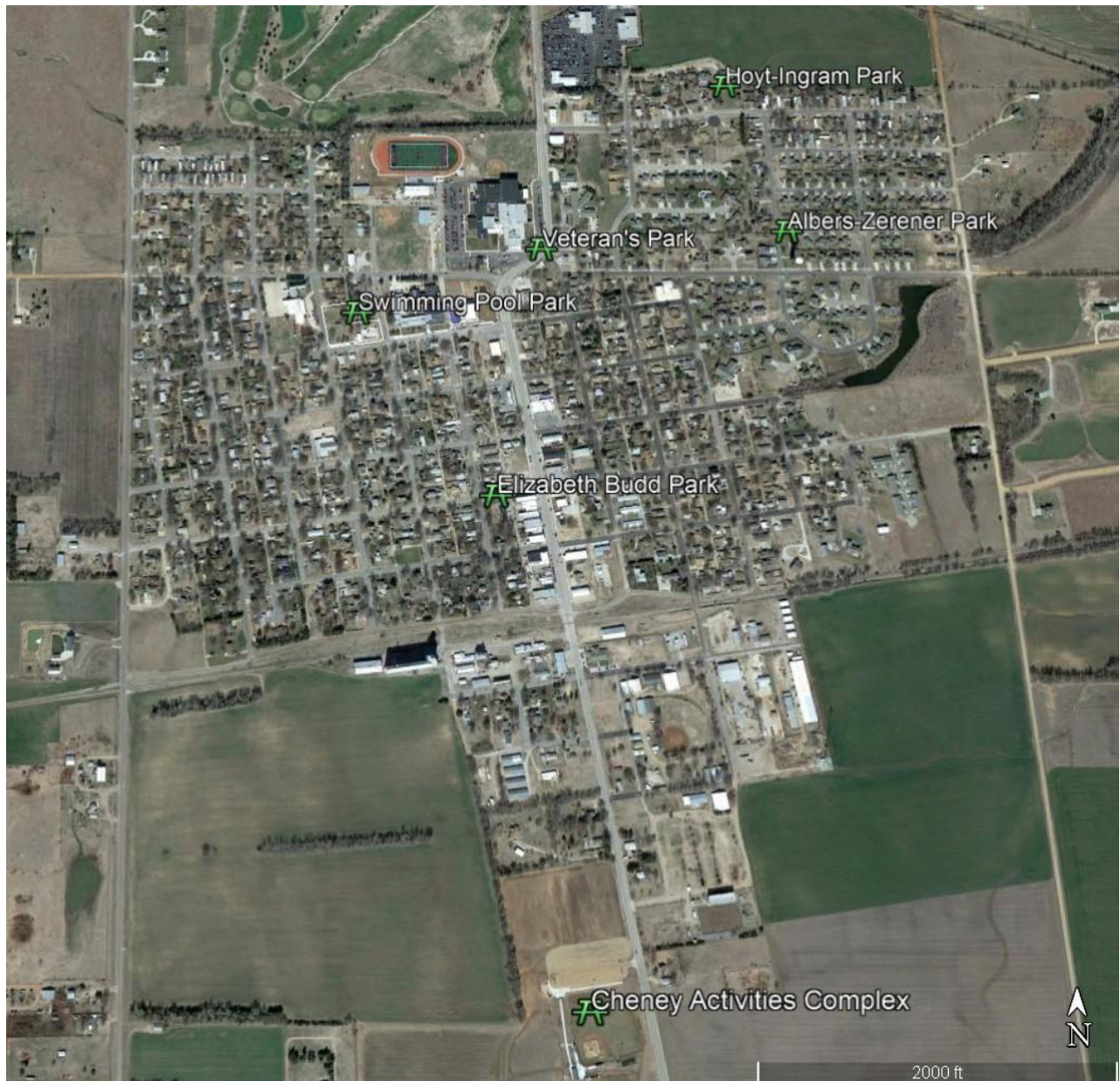
Cheney City Park Locations