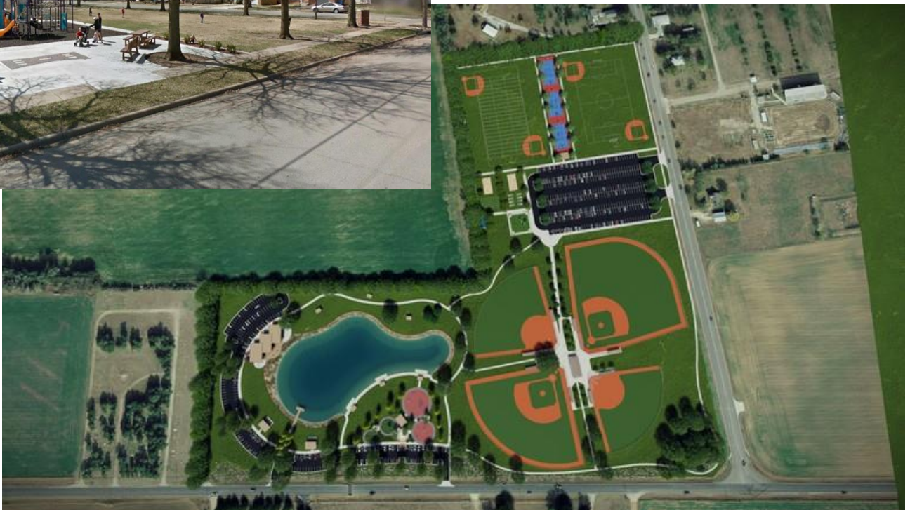
Cheney Activities Complex Conceptual Plan