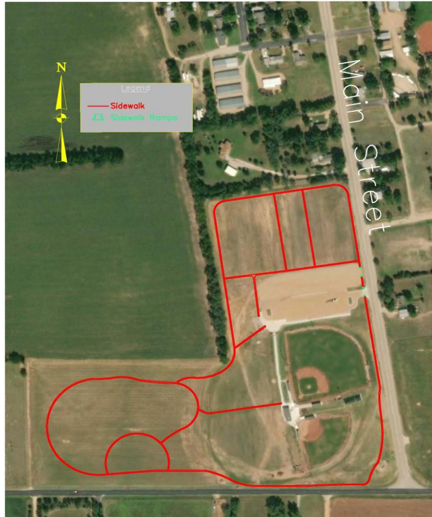
Activities Complex Conceptual Trail Plan

The city has identified the construction of a paved shared-use recreational trail at the Cheney Activities Complex as its first priority for trail improvements. The construction of the complex started in 2016. Currently, there are two baseball diamonds, a small playground and a parking lot. Still to be constructed are two more ball diamonds, two soccer fields, a splash park, another parking lot and a pond. Construction of this trail will allow connectivity within the complex and also create Cheney's first off-street recreational hike and bike trail. The goal is to provide residents with a place to walk or bicycle in a safe, relaxed environment so they are encouraged to spend more time outdoors. This aligns with the America's Great Outdoors (AGO) initiative established in 2010 by then President Barack Obama. The AGO initiative is highlighted in the 2015 Kansas Statewide Comprehensive Outdoor Recreation Plan (SCORP) and recognizes the following three core elements: