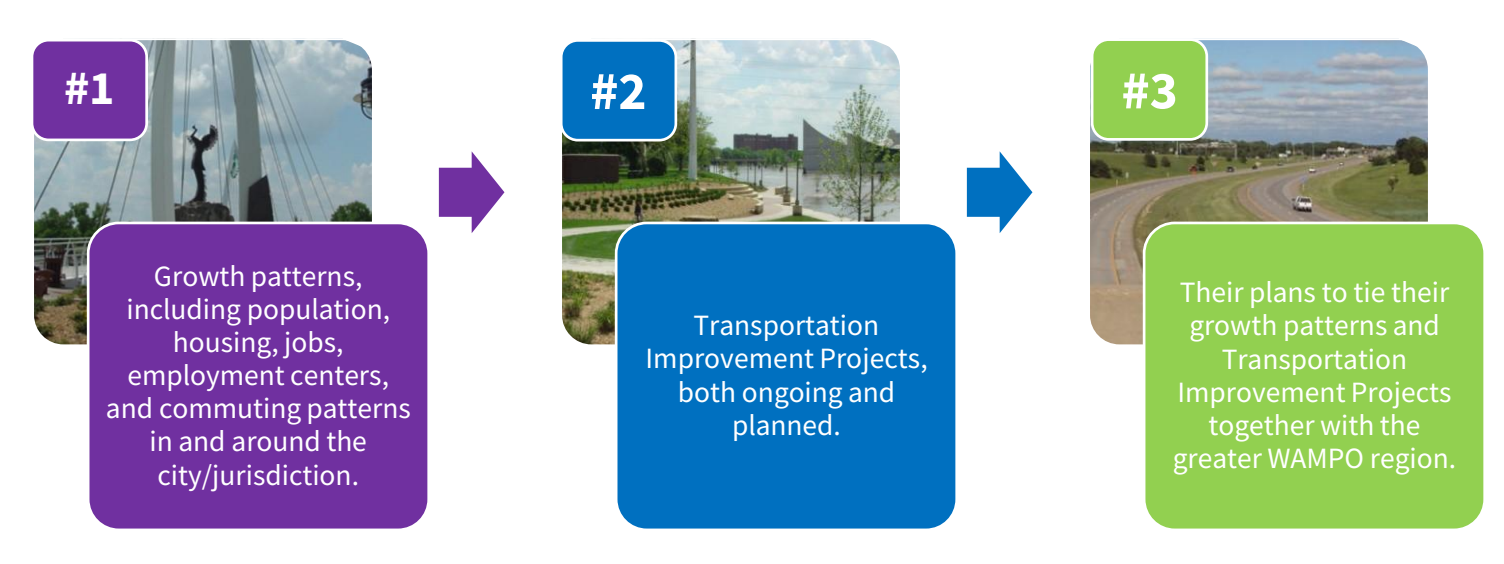
Figure 2: Three guiding themes of regional connections for the WAMPO region

In 2021, WAMPO invited eleven WAMPO region cities, or municipalities, to present at Transportation Planning Body (TPB) meetings about their regional connections. They were invited to speak about three main themes related to regional connectedness, as shown in Figure 2. These themes and presentations were designed to provide a framework and platform in which representatives might outline how their city has been growing and changing through time, as well as how they interact with the larger WAMPO region economically, culturally, and in terms of transportation.